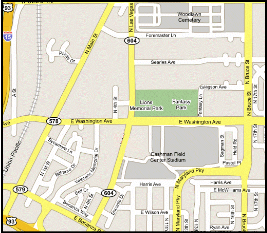
Cashman Field Street Map